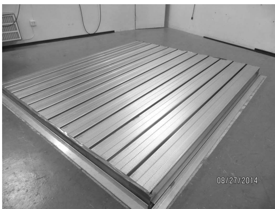
Figure 1 - Specimen mounted in the test chamber.

<u>RAL<sup>тм</sup>-A14-189</u> Page 2 of 6