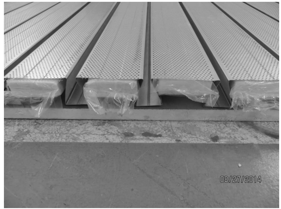
Figure 2 - Detail of the test specimen.