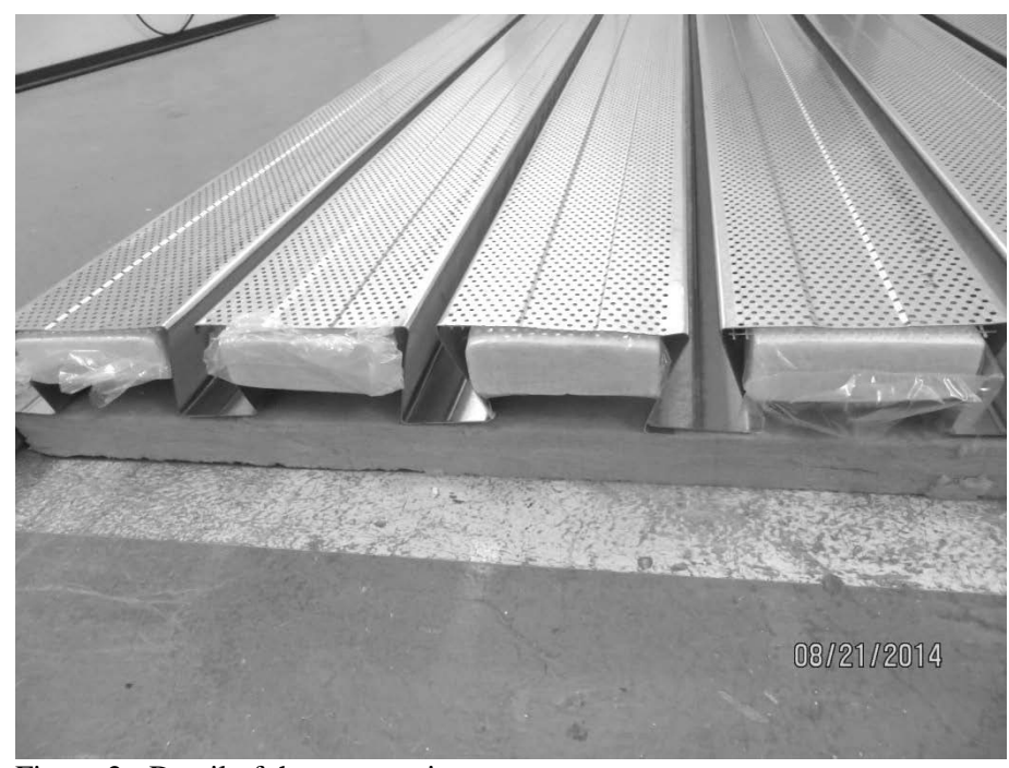
Figure 2 - Detail of the test specimen.