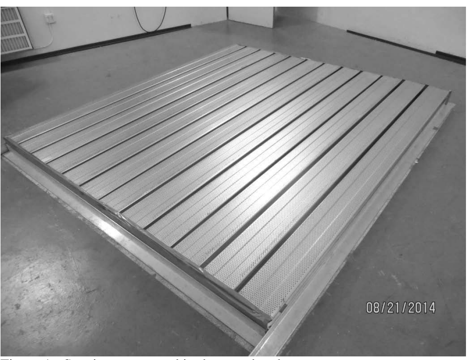
Figure 1 - Specimen mounted in the test chamber.