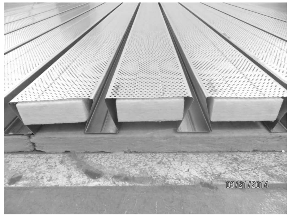
Figure 2 - Detail of the test specimen.