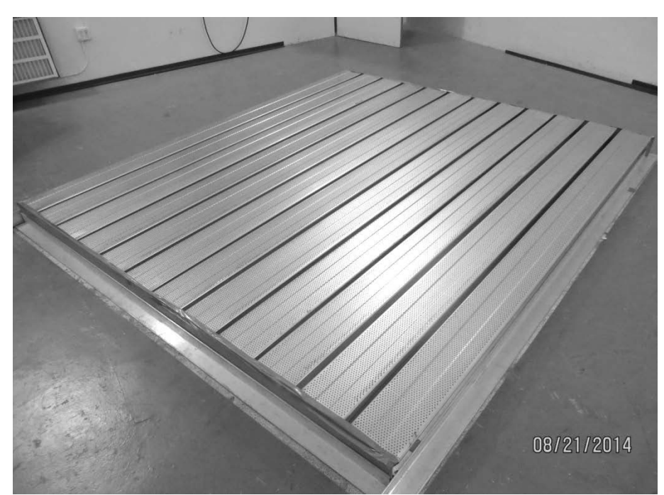
Figure 1 - Specimen mounted in the test chamber.