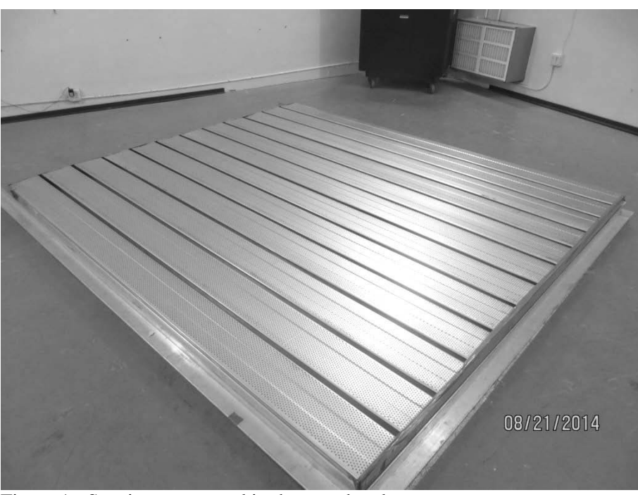
Figure 1 - Specimen mounted in the test chamber.