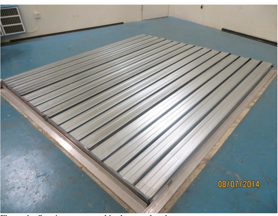
Figure 1 - Specimen mounted in the test chamber.