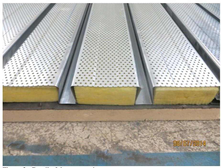
Figure 2 - Detail of the test specimen.