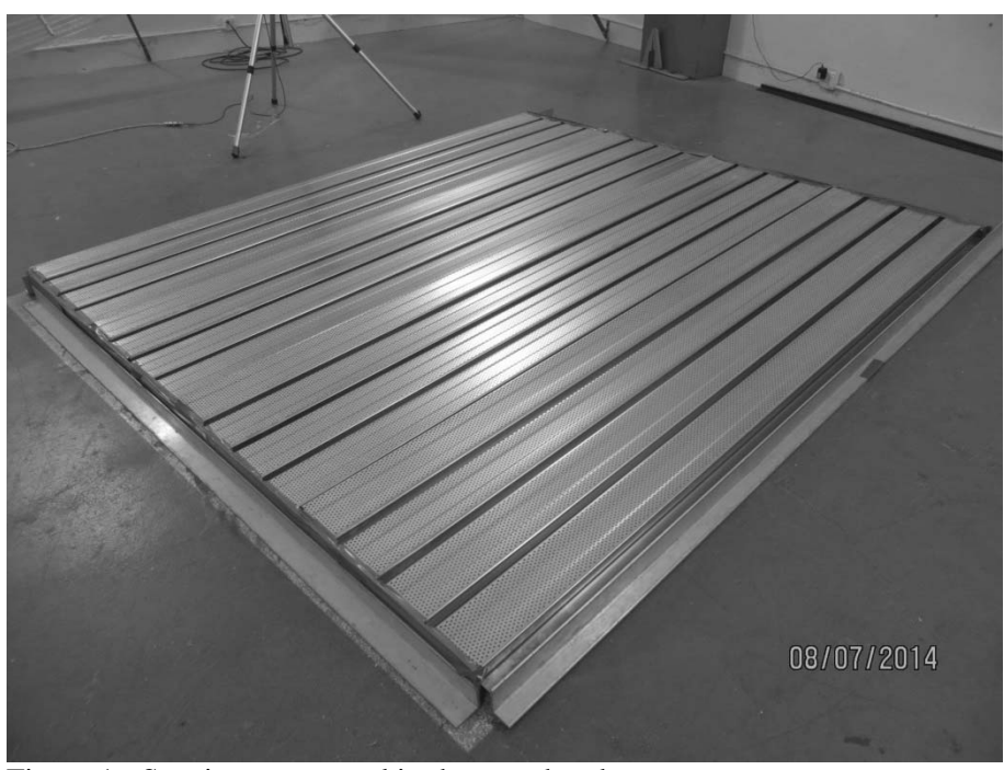
Figure 1 - Specimen mounted in the test chamber.