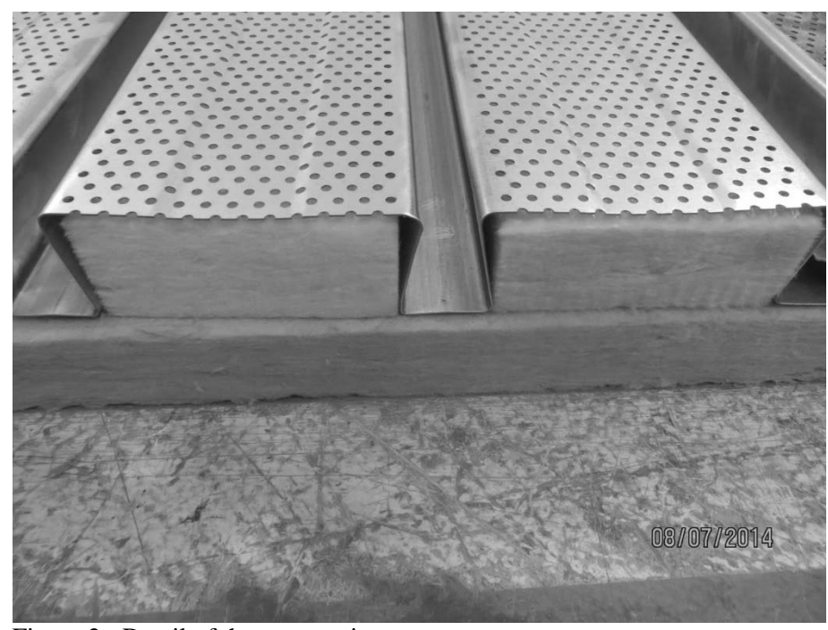
Figure 2 - Detail of the test specimen.