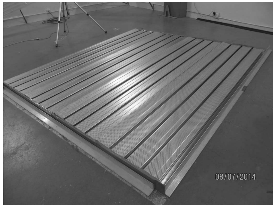
Figure 2 - Detail of the test specimen.