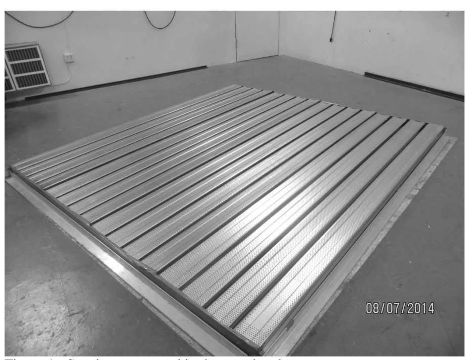
Figure 1 - Specimen mounted in the test chamber.