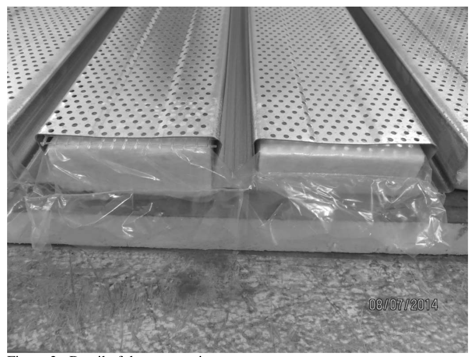
Figure 2 - Detail of the test specimen.